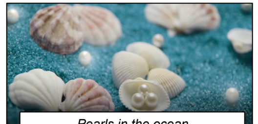
Pearls in the ocean

Instructions: Use the information in TEXT 1 to answer the questions below. Read the questions, and choose the correct answer, A , B , or C .