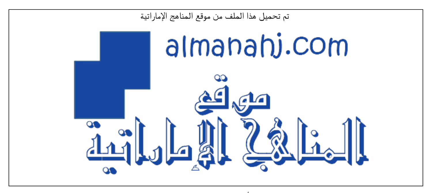
*للحصول على أوراق عمل لجميع الصفوف وجميع المواد اضغط هنا