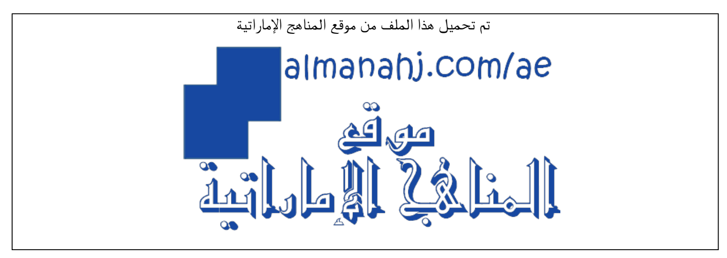
*للحصول على أوراق عمل لجميع الصفوف وجميع المواد اضغط هنا