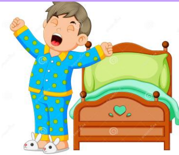
Get up/ wake up