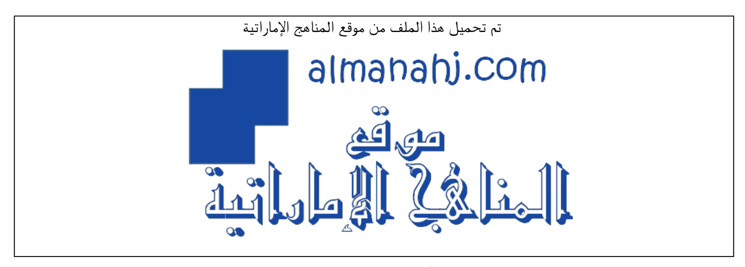
*للحصول على أوراق عمل لجميع الصفوف وجميع المواد اضغط هنا