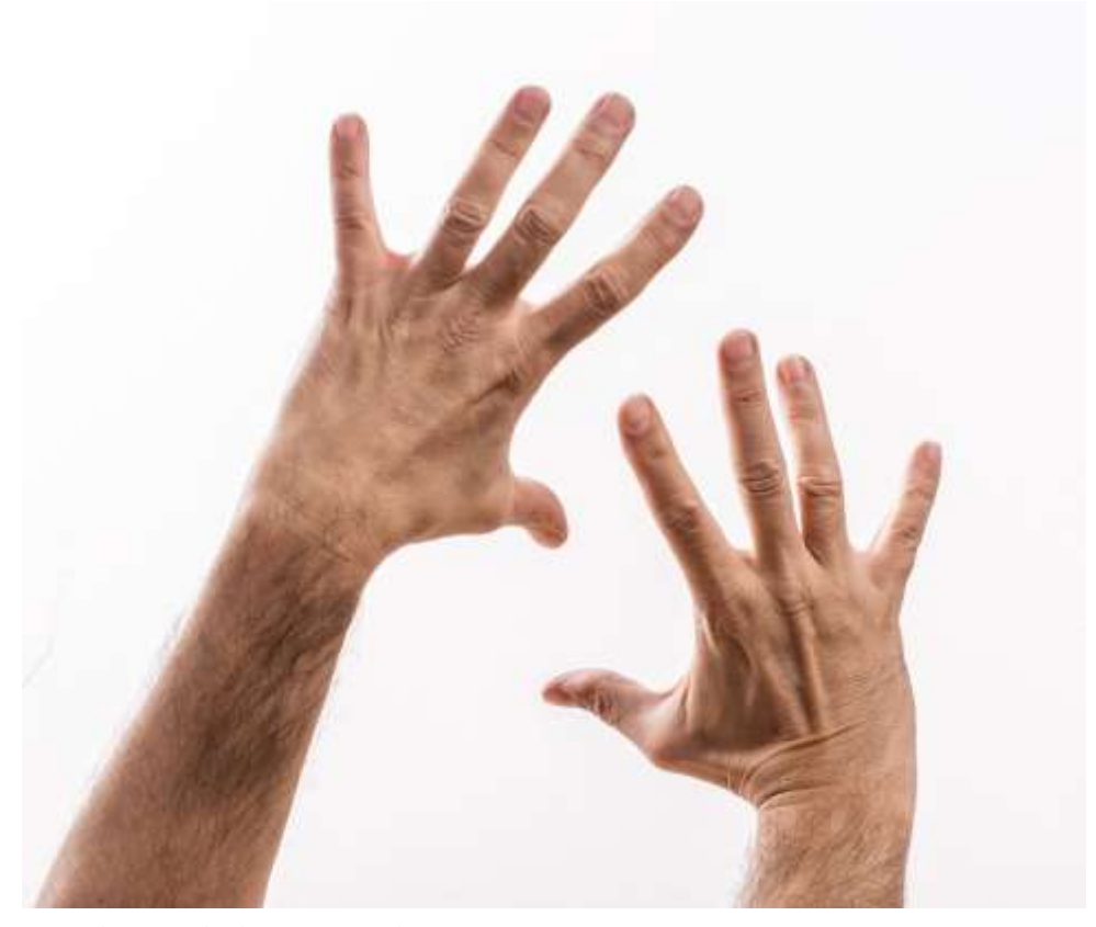
<u>Hand wave</u>