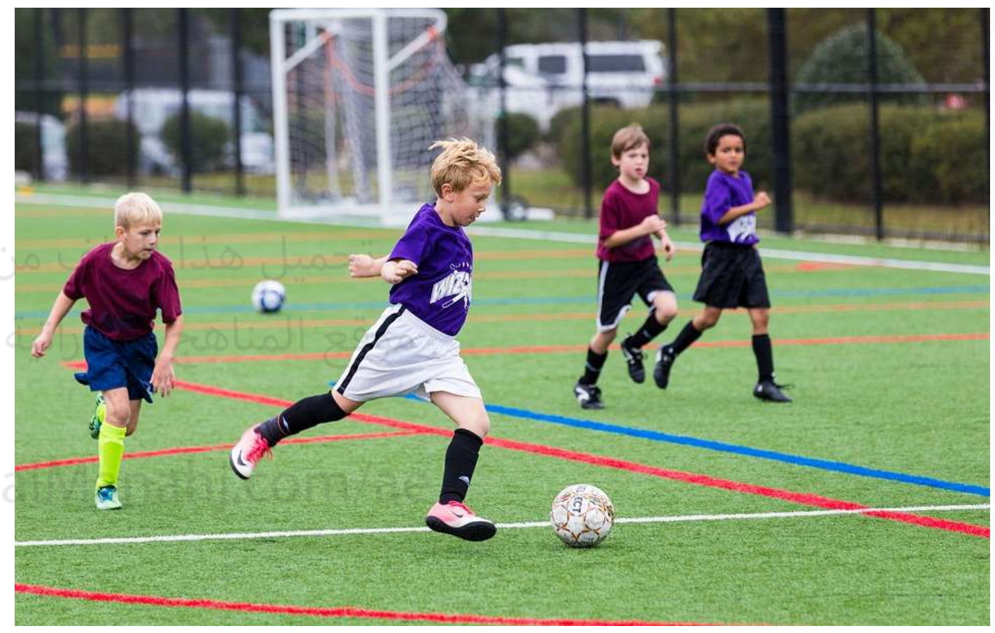
Soccer