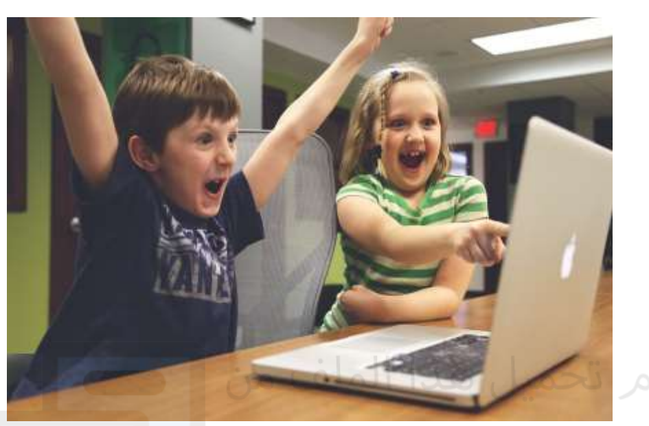
Winning, StartupStockPhotos, January 8, 2015, Pixabay