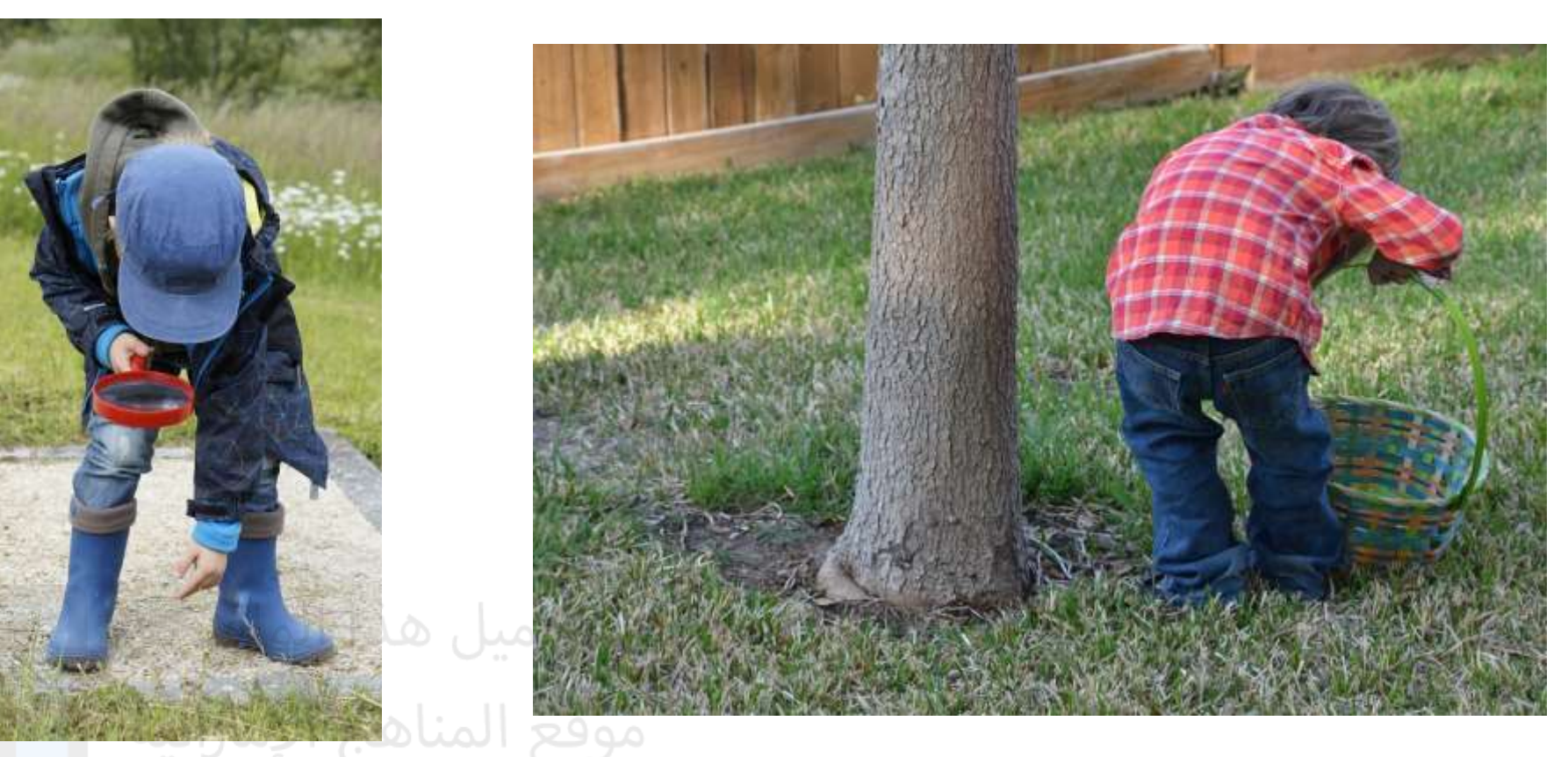
Detective, Efraimstochta 2015, Pixabay