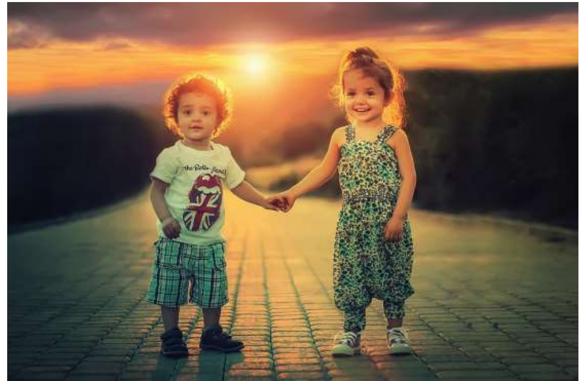
Together , Bessi 2015, pixabay