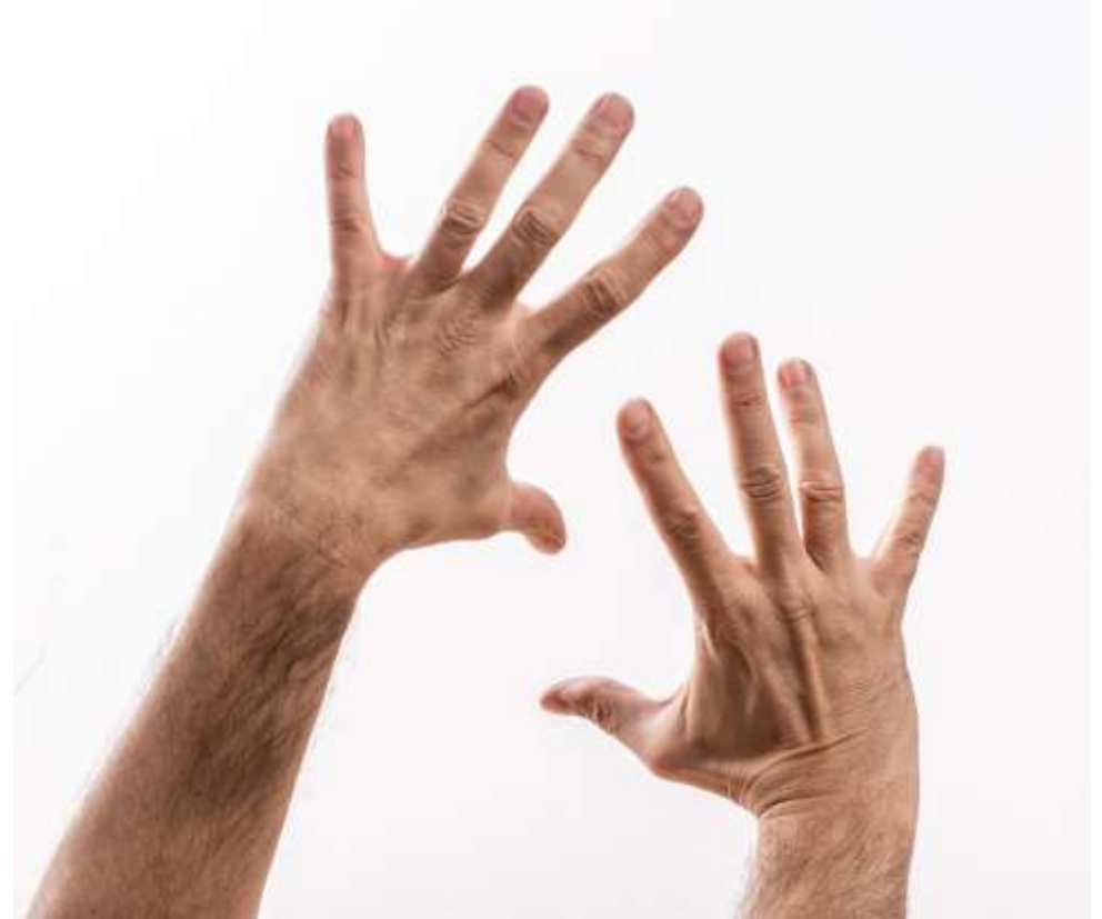
Hand wave