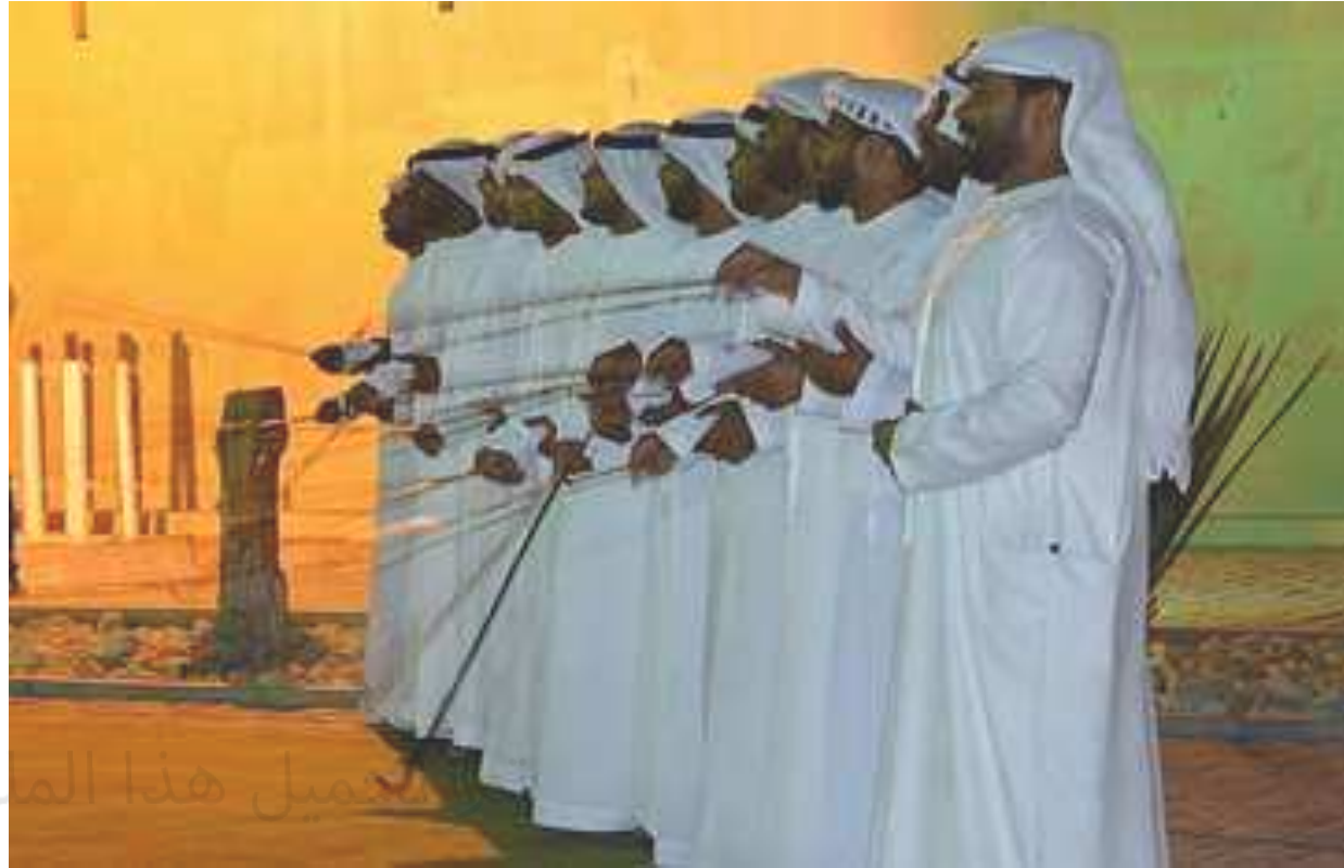
Al Ayala 'stick dance' by Rankin73, 2018, CC BY-SA

موقع السامح الإماراتية تحميل هذا الملف من