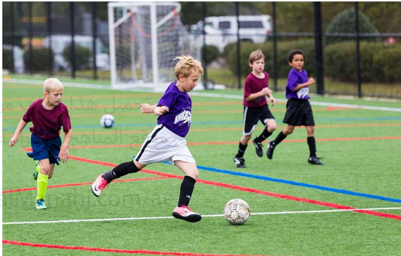
Soccer