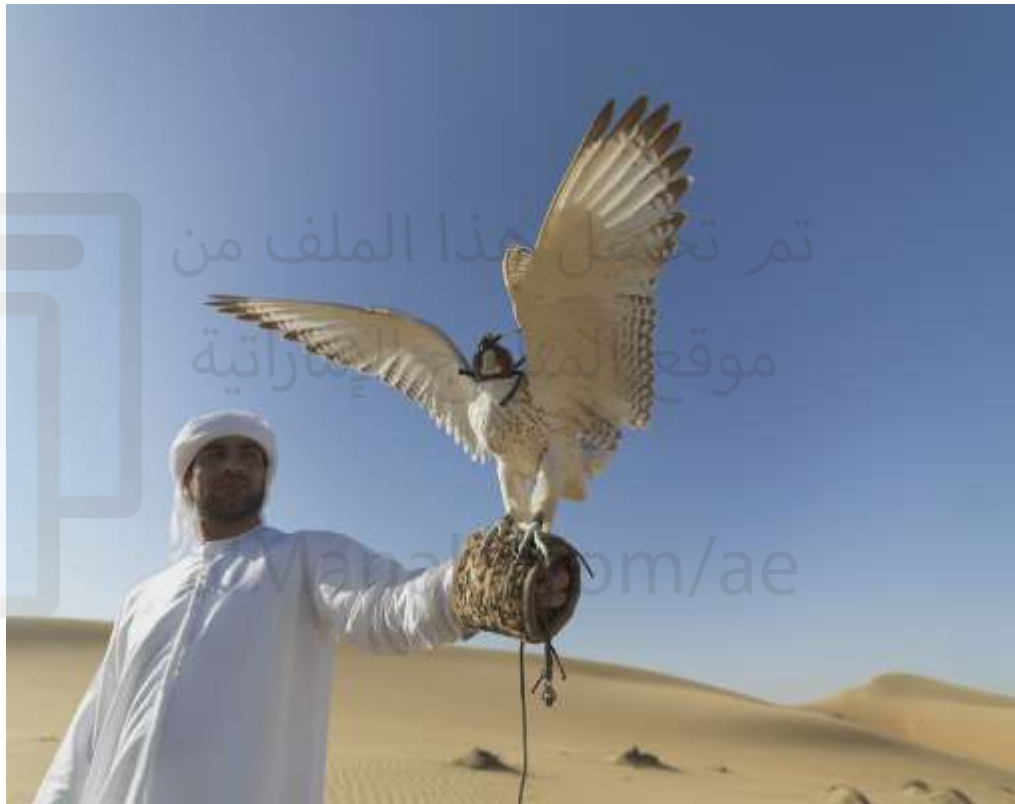
Falcon UAE