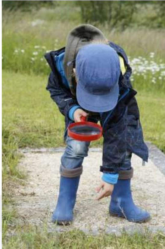
Detective , Efraimstochta 2015, Pixabay