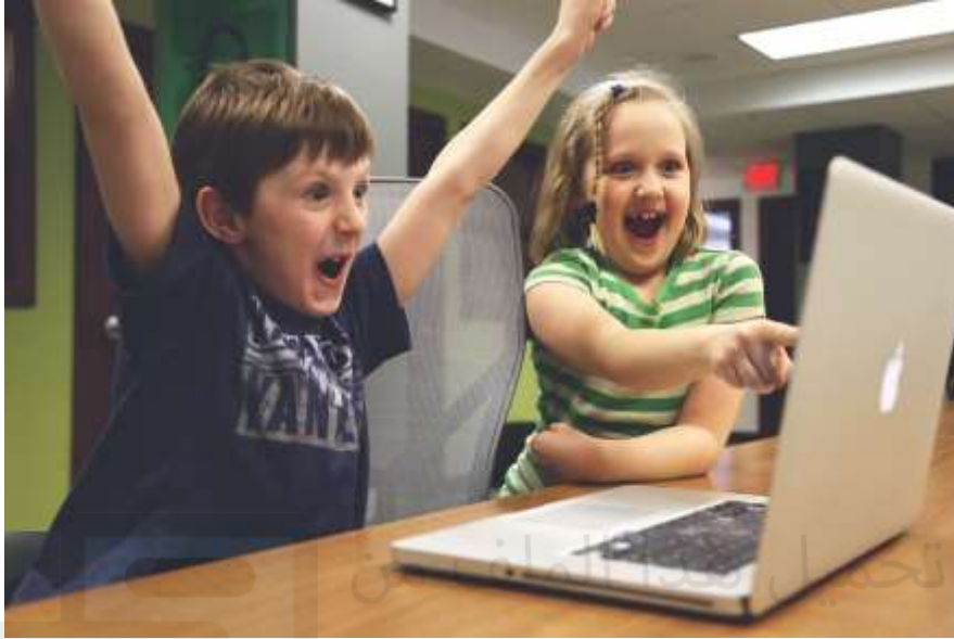
Winning , StartupStockPhotos, January 8, 2015, Pixabay