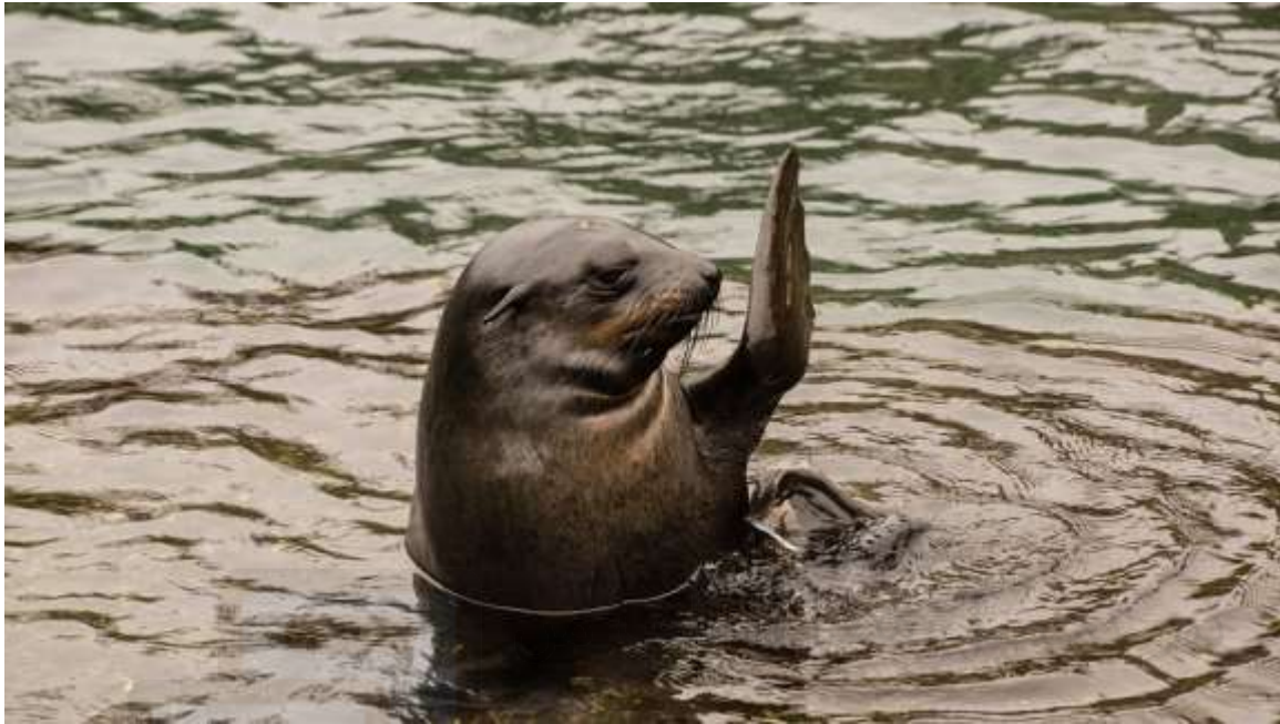
Hello , Taken 2016