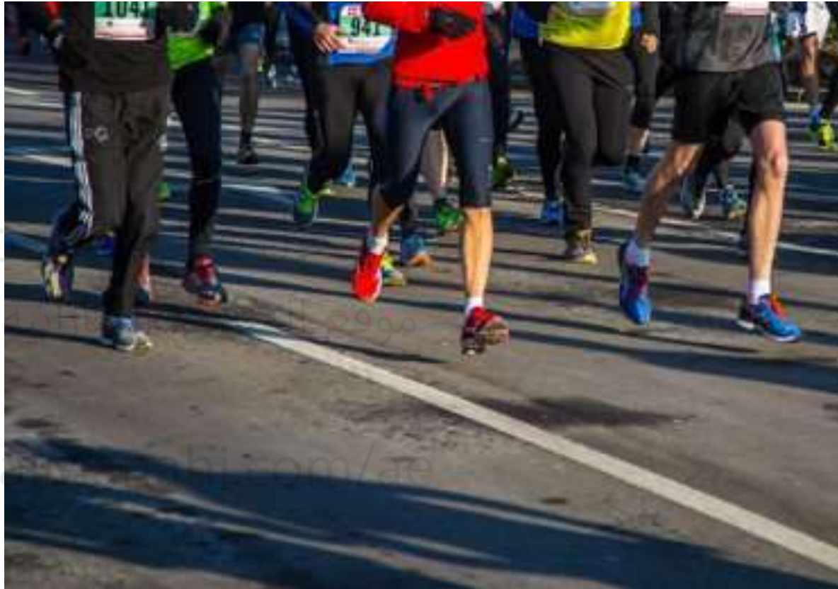
marathon