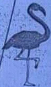
flamingo / fly