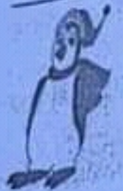
like / penguin

6- Write a sentence under each picture describing it: (3 Marks)