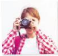
take a picture