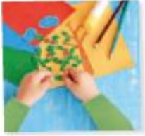
make a collage