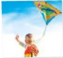
fly a kite