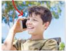
talk on the phone