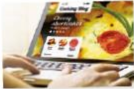
surf the Net