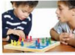
play board games