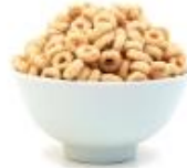
a bowl of cereal