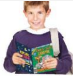
read a comic book