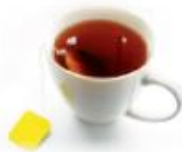
a cup of tea