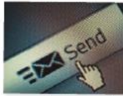
send an email