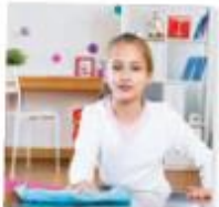
tidy my room