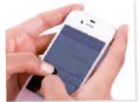
text a friend

Fill in the gaps with the suitable words from the box: