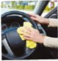
clean the car