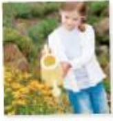
water the plants