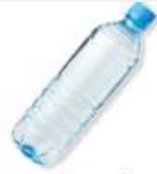
a bottle of water