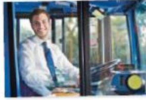
drive a bus