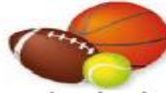
physical education (PE)