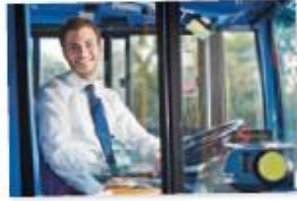
drive a bus