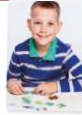
do a puzzle