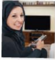
watch TV/ a DVD