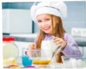
make a cake