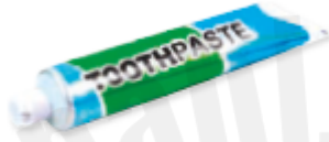
a tube of toothpaste