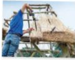
make a shelter