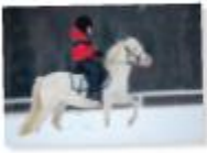
ride a horse