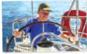
sail a boat