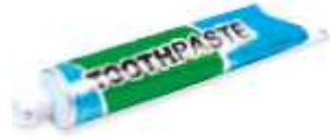
a tube of toothpaste