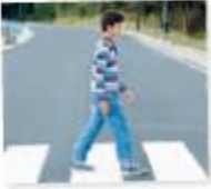
cross the street