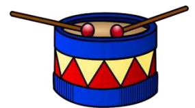
( tone - drum )