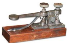
(telegraph - telephone)