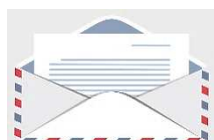
( email -letter )