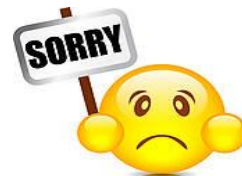
( apologize - import )