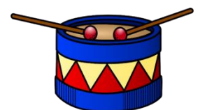
( tone - drum )