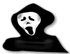
(comedy - horror)