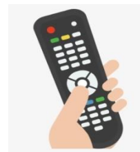
(remote control - calculator)