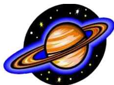
(planet - meteorite)