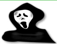
(comedy - horror)