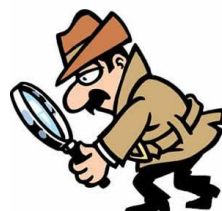
( cop - detective )