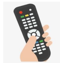
(remote control - calculator)