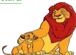
(epics - animation)