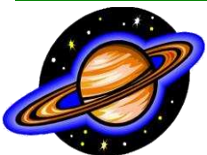
(planet - meteorite)